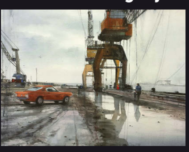
PABLO RUBEN Vanishing lines and shades of grey

PO-AN CHEN A different approach to colour and shape