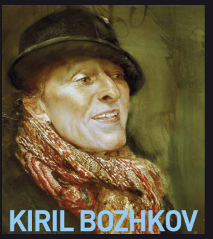
Portraits with an artistic touch