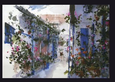
PEDRO OROZCO Getting the best from transparent washes

FRANCK HÉRÉTÉ Painting the heart of French cities