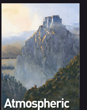
plein air paintings