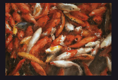
WANG WEI At the confluence of East and West