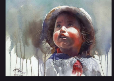
ROGGER ONCOY Portraits of the soul

N. SIMMONS Perfecting the use of acrylics