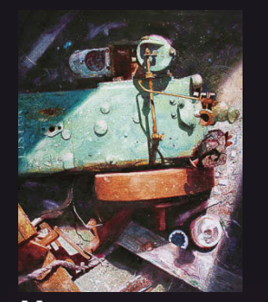
How to create a masterpiece