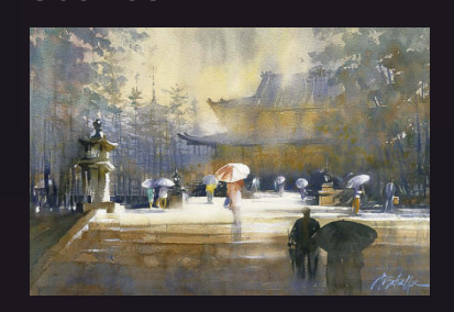
THOMAS SCHALLER Atmospheric street scenes