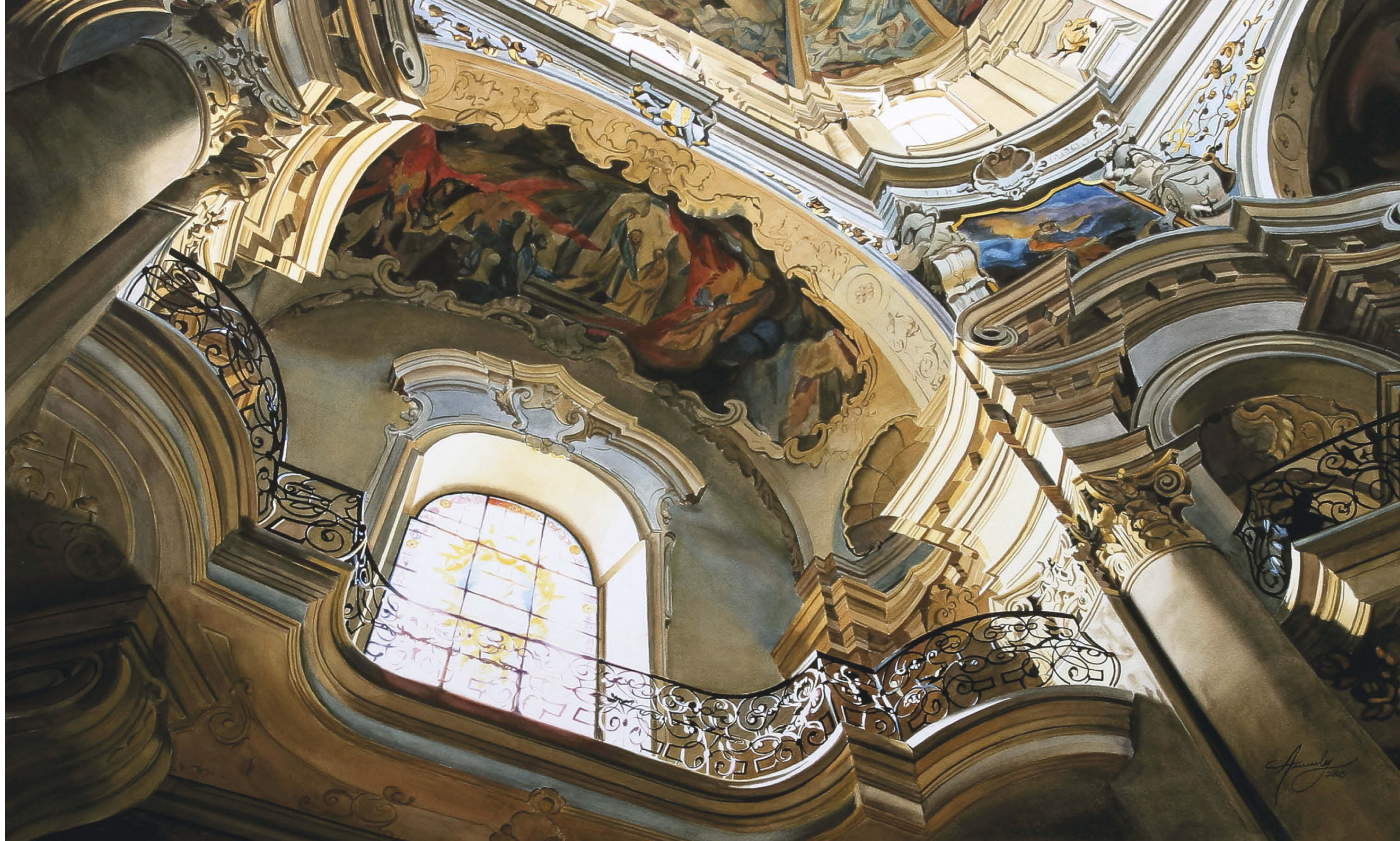
Clerestory. 2003. 68.5 x 109 cm.

IN THE WATERCOLOURS OF THIS CANADIAN ARTIST, AN ABUNDANCE OF DETAIL IS NOT SYNONYMOUS WITH A LACK OF EMOTION. ON THE CONTRARY, HER ARCHITECTURAL VIEWS SHOW BOTH VIRTUOSITY AND EMOTION. IN THIS EXCLUSIVE INTERVIEW, SHE EXPLAINS HOW SHE MANAGES TO REACH THIS DELICATE BALANCE.