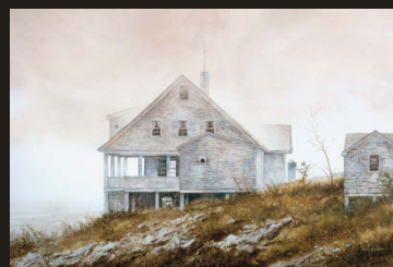
B. HENDERSHOT Traditional subjects with unusual technique

6 essential gestures to successfully paint radiant portraits