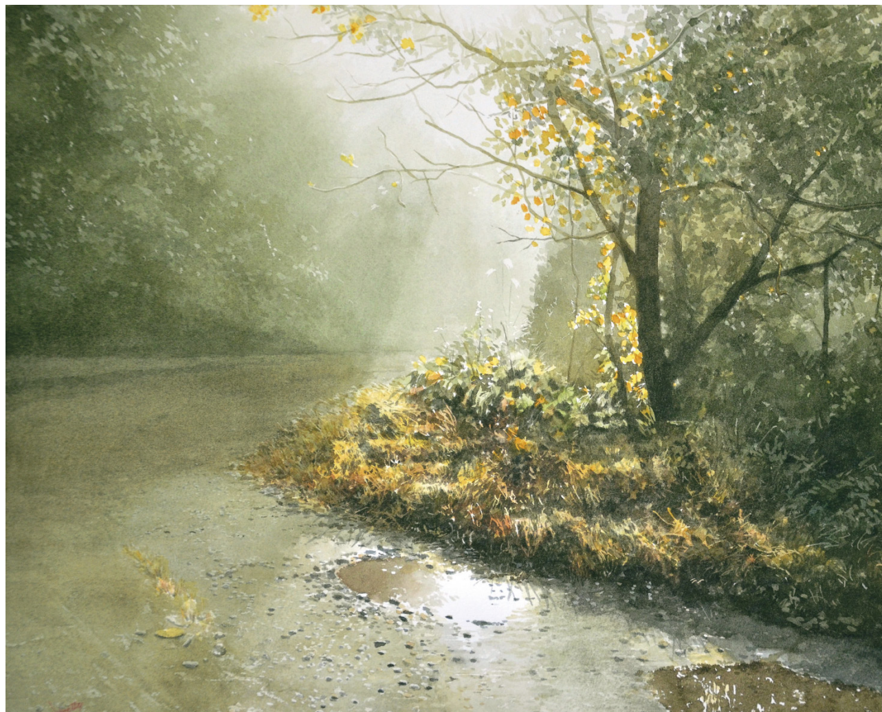
Grace. 2010. 32 x 41 cm. "In this work, light cherishes the spirit of prayer."