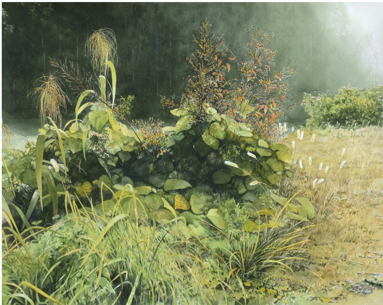
Born in Field. 2010. 80 x 100 cm. "Weeds born and dying, unbeknownst to anyone."