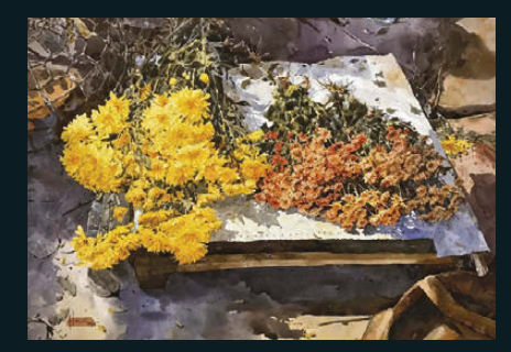
Hung Ho p. 58 The beauty of reality fused with free brushwork

Maurice Prendergast A life of artistic exploration p. 92