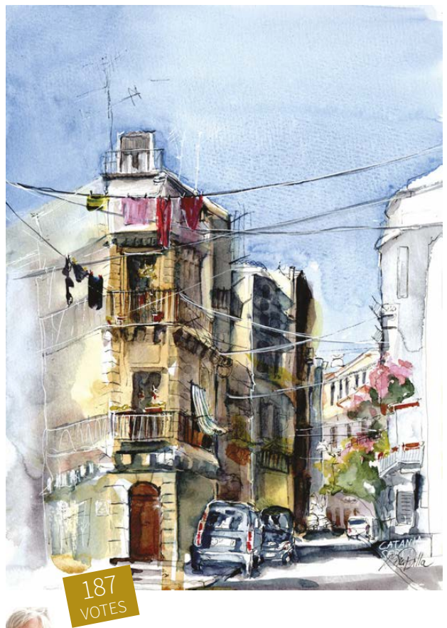
Street in Catania. 2019. Watercolour, Sketch. 21 x 15 cm. Alexa Dilla

The Teacher. Watercolour. 35 x 50 cm. Annie Strack