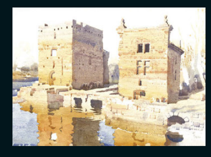
Nicholas Poullis Capturing the light of the south of France