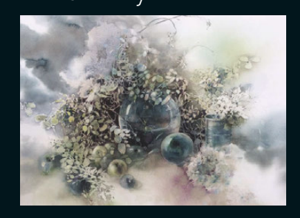
Bénédicte Stef-Frisbey Watercolour: a lesson in humility