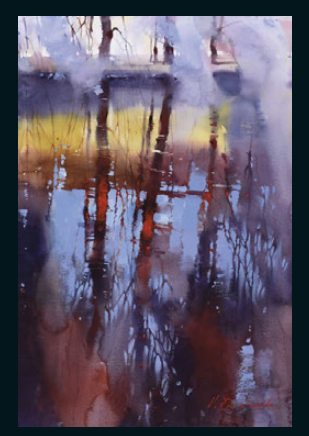
Viktoria Prischedko Juxtaposition of pure colour

Igor Mosiychuk Light and contrast to create atmosphere