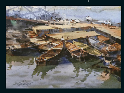
Ye Yint Myint Naing Rhythmic variations of tone and shape